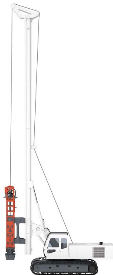
Piling rig mounted